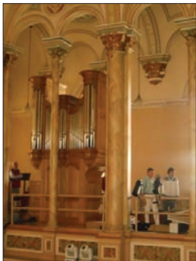
Musée de l'Amérique française organ