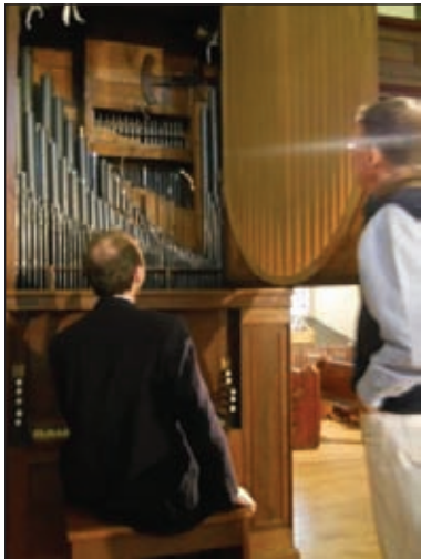
Holy Trinity Anglican Cathedral 1790 English organ