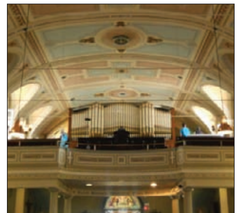
Chapelle des Jésuites organ