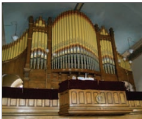
St. Andrew's Presbyterian Church organ