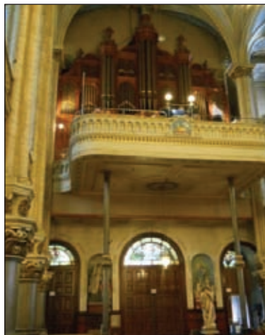
Église Saint-Jean Baptiste organ