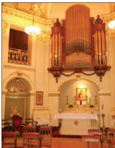
Basilique-Cathédrale de Québec Chapel organ

Notre-Dame de Québec was erected in 1647 and in 1674 the church took the title of Cathédrale, following the appointment of Mgr. de Laval as bishop of the new diocese of Québec. It was razed by the bombardments that occurred during the Siege of Quebec in 1759, but was reconstructed a few years later and although it did have a new organ, the organ was imported from England due to a trade embargo on goods coming from France. In December, 1922, a fire once again destroyed the Cathédrale. However, within a year, work began on the construction of a new church. There are three organs in the Cathédrale which date from the years just after the construction of the new building. The Gallery Organ is