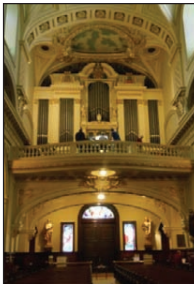
Basilique-Cathédrale de Québec organ

de Québec is near the centre of the old City and is the third church to bear that name and the fourth church on the same site. The first church was a small chapel built by Champlain in 1633. The first